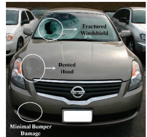
Figure 3: Forward projection impacts generate a typical damage pattern that includes front bumper damage, a dented hood, and a fractured windshield.

The type of vehicle-pedestrian interaction can often be established from the vehicle damage. For forward projection impacts, the vehicle typically has damage to the front bumper cover consistent with initial leg contact, a dent close to the leading edge of the hood consistent with hip or pelvis contact, and a dent at the top of the hood or fracture at the base of the windshield consistent with head strike (Figure 3).