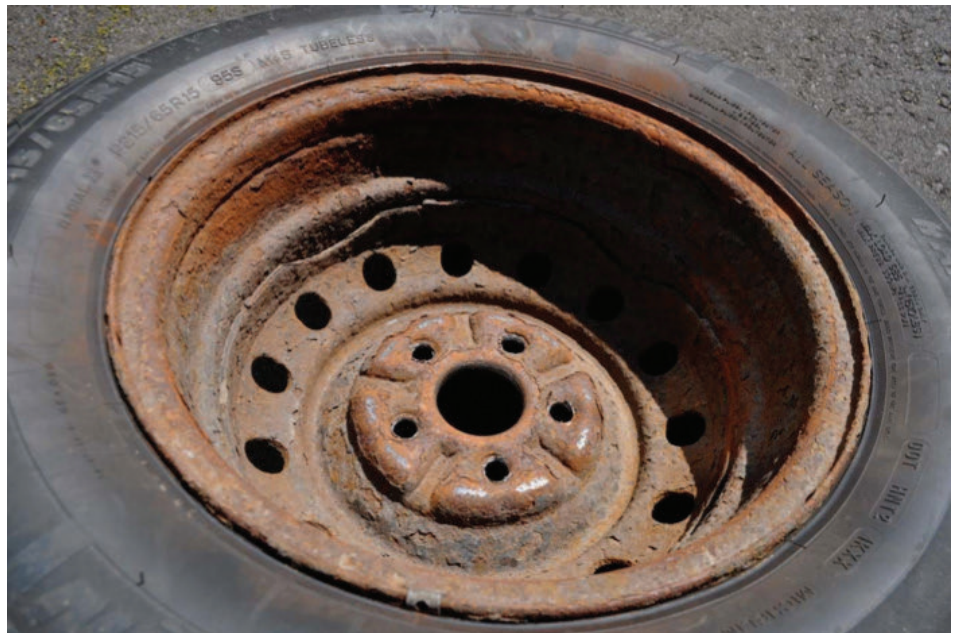
Figure 10. A badly corroded wheel separated because rust deposits were not cleaned off properly before it was installed.

Wheel separations can occur from axle failures, hub failures, or fastening failures, with fastening failures being the most common. A fastening failure is when the nuts on the ends of the studs unthread by themselves and fall off (typically on left-side wheels), or when the metal wheel studs break off (typically on right-side wheels). The physical evidence in left- and right-side wheel separations differs, but is most often produced by the same cause: a loss of clamping force, where the clamping force is the force produced by wheel nuts pulling on wheel studs to squeeze the wheel onto the vehicle.