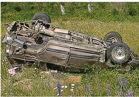
Figure 4. Eyewitnesses observed the left rear wheel separate from this SUV before it lost control and rolled. All five nuts were missing from the wheel studs of the left rear wheel.