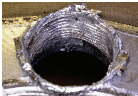
Figure 5. This stud (right) and wheel hole damage (above) is from a left-side wheel separation that occurred 21 days after the wheel was installed.