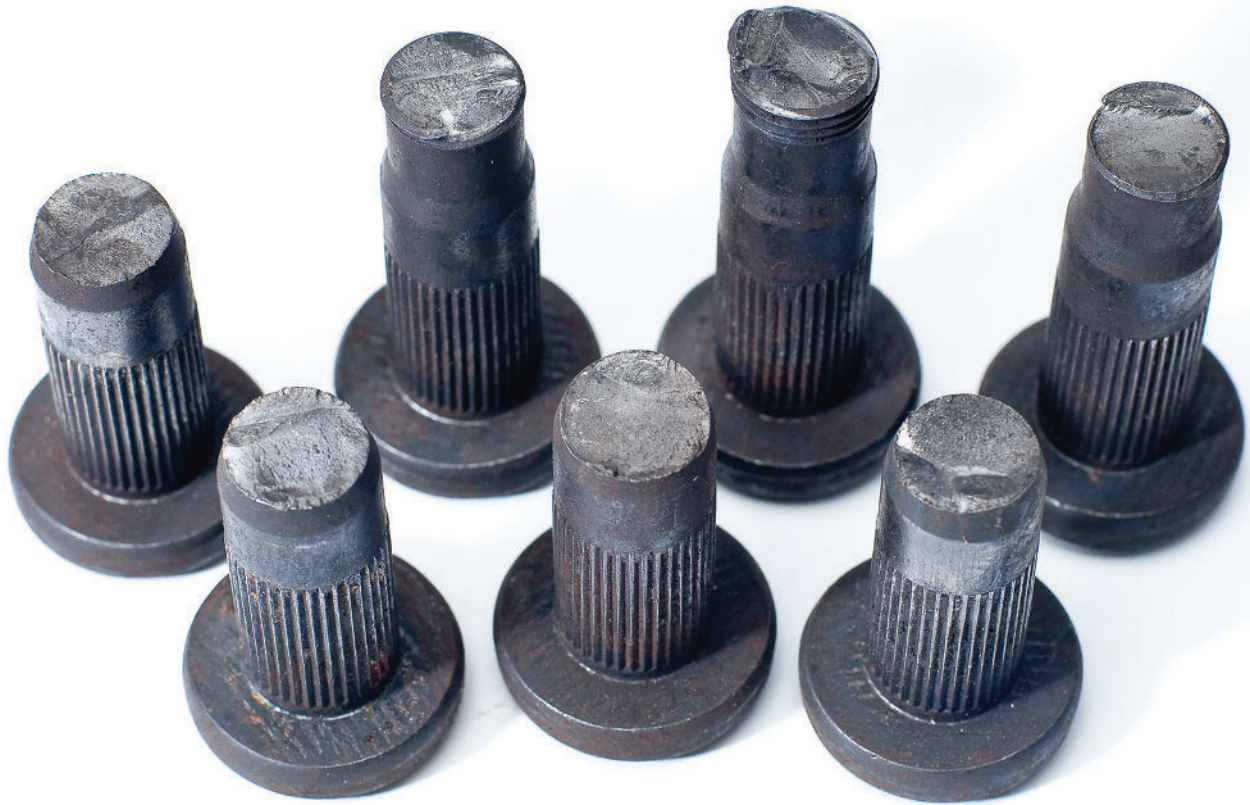
Figure 6. Fatigue fractures on studs from a motor home right-side wheel after 2900 miles. Fatigue fractures are usually flat and transverse to the stud axis.