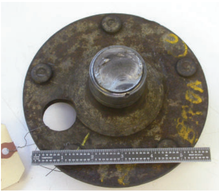
Figure 2. The end of a Ford Bronco axle broke off one month after it was serviced. During the service an axle bearing was carelessly removed with a cutting torch, which metallurgically altered the axle and led to a catastrophic fatigue fracture.

The wheel nuts and studs basically sandwich the wheel and brake components together. The nuts and studs have to squeeze those components together with enormous force, called the clamping force, in order for the sandwich to stay together. The clamping force is made when the nuts are tightened onto the studs. If the clamping force is lost, then the nuts loosen, leading to the different mechanisms of left-side nut spin-off and right-side stud reversed-bending fatigue.