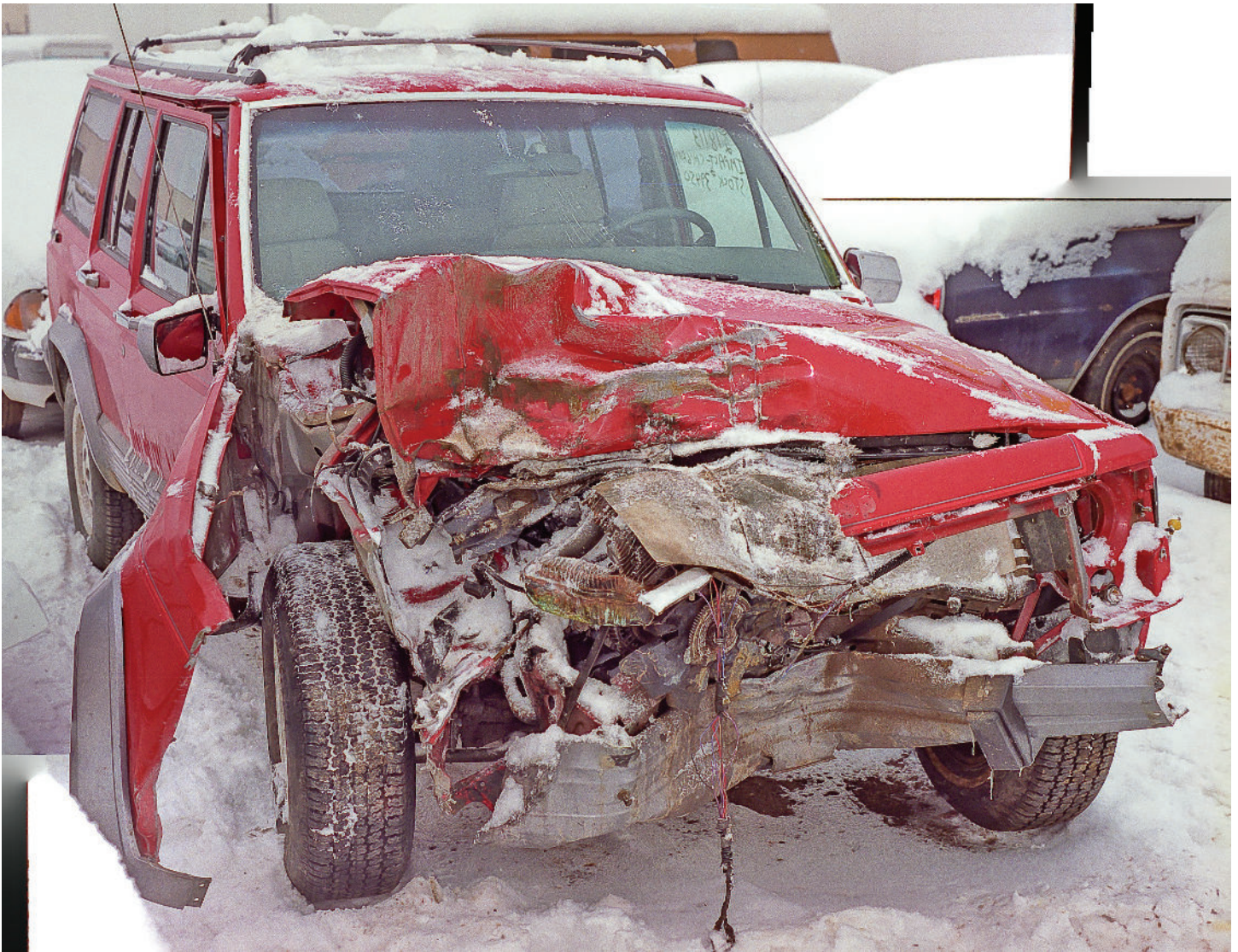
Figure 1. Front-end damage from head-on impact with separated dual heavy truck wheels.

From our case data we find that when wheels separate, the majority of them do so in three distinct ways. In order, from most rare to most common, these are: