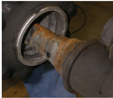
Figure 3. A heavy truck hub had a bearing failure and the consequent friction destroyed the hub and allowed it to come off the end of its axle.