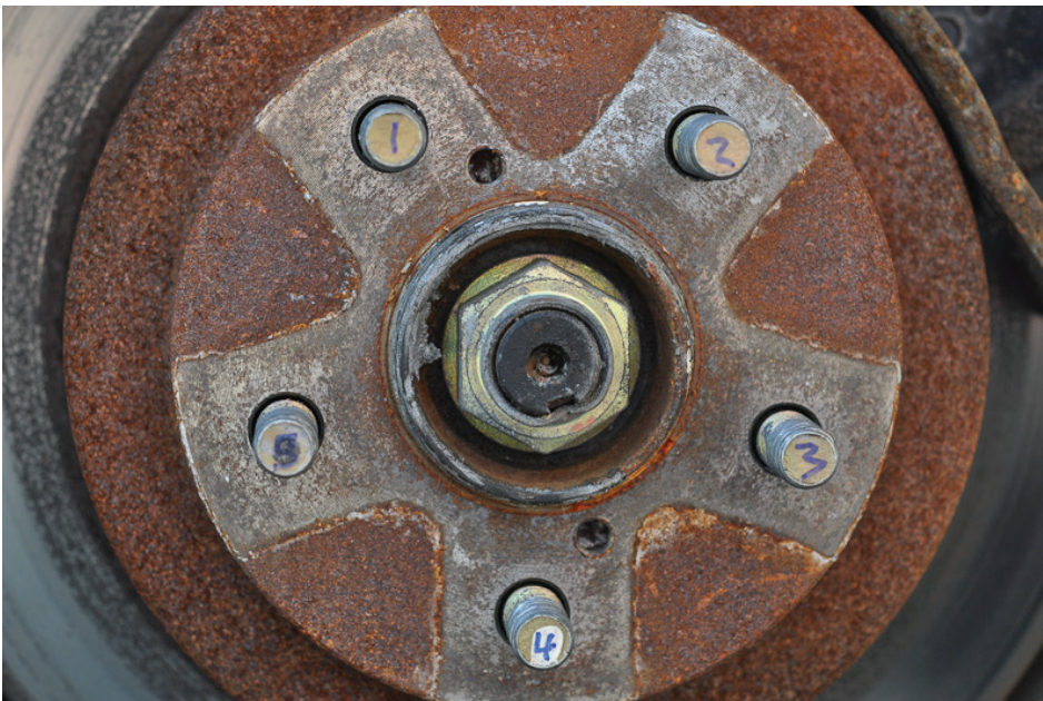
Figure 9. The minor rust deposits on the edges of the contact area of this aluminum wheel are normal, but the contact patch (five white arms outlined by rust) on the brake rotor must be clean.